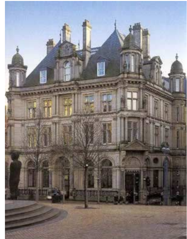
Victoria Square House, Birmingham